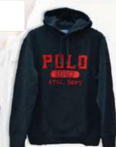
REF : TH-EE-M-0581 BRAND: POLO RALPH LAUREN FABRIC : Top peached & Brushed fleece COMPOSITION : 50%BCI Cotton 40%polyester GSM : 380