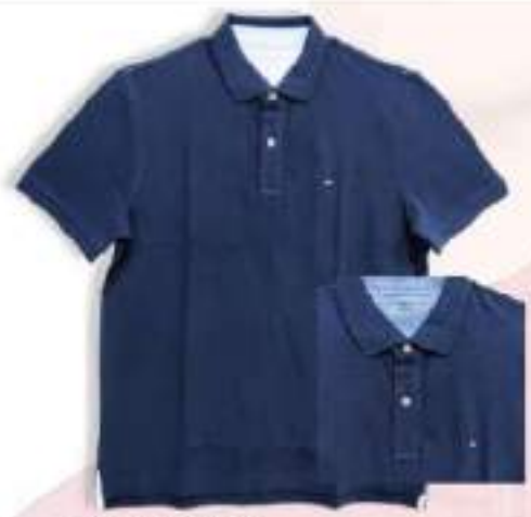
Ref No: TH-EE-M-0575 Brand: Tommy Hilfiger Fabric: Pique Composition: 100%BCI cotton GSM: 200 GSM