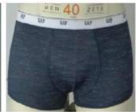
REF NO: - EE 008 FABRIC : INJECTED SPANDEX JERSEY COMP : 80% COTTON, 30% POLYESTER, 10% SPANDEX GSM : 150