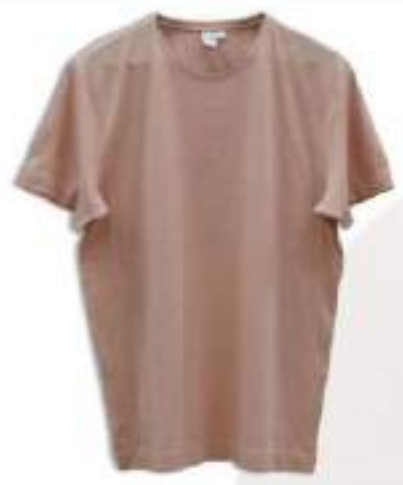
STYLE NO: TH-EE-M-815 FABRIC: Single jersey COMPOSITION: 100% cotton GSM: 180