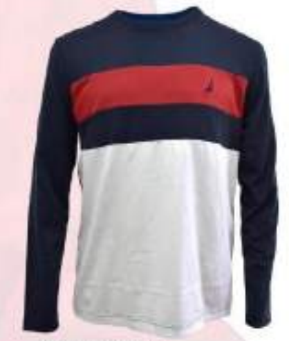
Ref No: EE-NU-M-061 Brand: Nautica Fabric: Single Jersey Composition: 100% Cotton GSM: 160