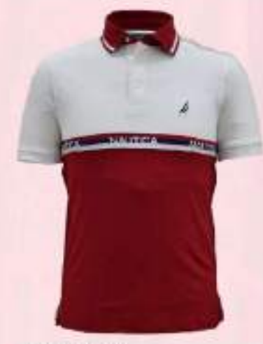
REF : NAU - 008 BUYER: NAUTICA FABRIC : PIQUE COMPOSITION : COT, SPANDEX, 94/4 GSM : 205