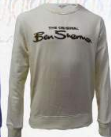
REF:EM-BS-003 BRAND: BEN SHERMAN DESCRIPTION: MENS' LS CREW NECK FABRIC:100% ORGANIC C/TN FRENCH TERRY 300GSM