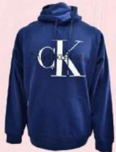
Ref No: EE-CK-M-015 Brand: Calvin Klein Fabric: Cross Loop Knit Composition: 100% Cotton GSM: 400