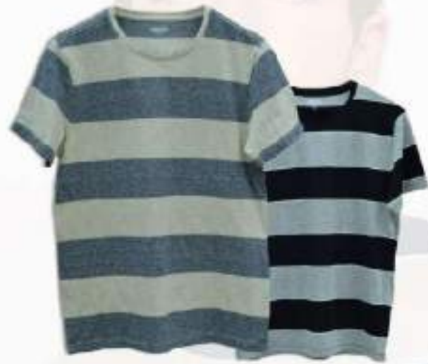
Ref No: TH-EE-M-863 Brand: Old Navy Fabric: Single Jersey Y/D Composition: 60% ctn 40% poly GSM :170