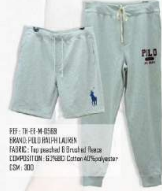
REF : TH-EE-M-0569 BRAND: POLO RALPH LAUREN FABRIC : Top peached & Brushed fleece COMPOSITION : 60%BCI Cotton 40%polyester GSM : 300