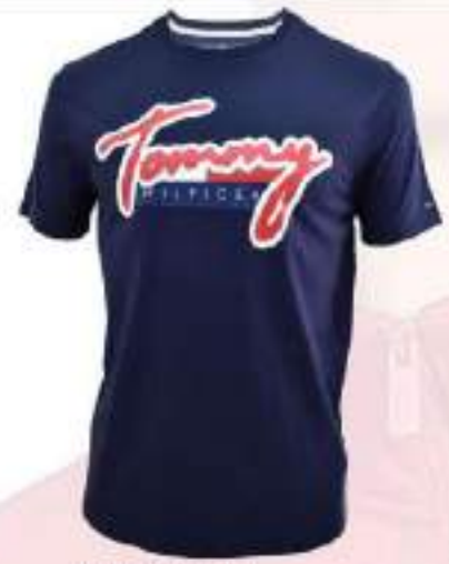
Ref No: EE-TH-M-002 Brand: Tommy Hilfiger Fabric: Single Jersey Composition: 100% Cotton, 26/1s GSM: 170 GSM