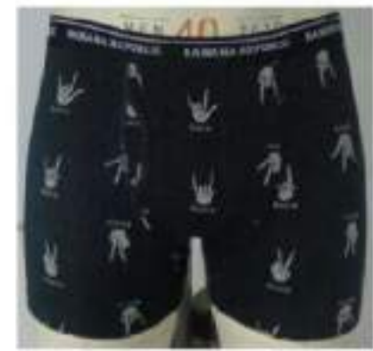
REF NO: - EE 014 FABRIC : LYCRA JERSEY COMP : 98% COTTON, 7% SPANDEX GSM : 175 SUPIMA COTTON