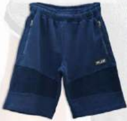
Ref: TH-EE-N-0607 Customer: Police Description: Mens Shorts Fabric: Cross Loop knit - 100% cotton