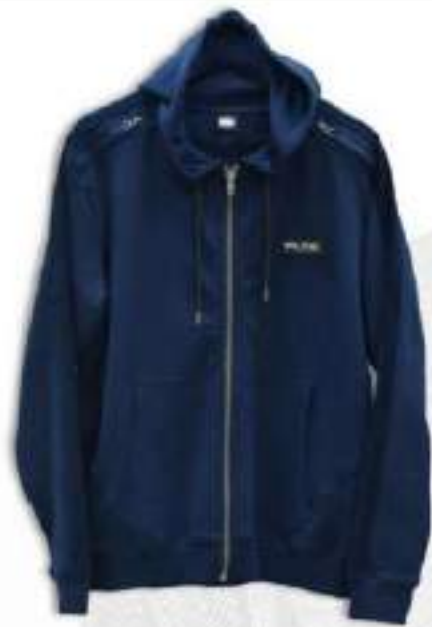
Ref: TH-EE-M-0608 Customer: Police Description: Mens Hoodie Fabric: Cross Loop knit - 100% cotton