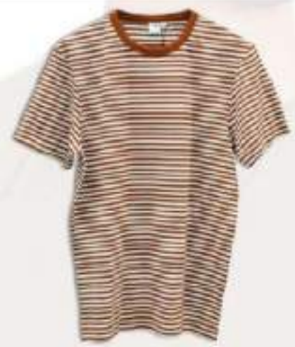
STYLE NO: TH-EE-M-816 FABRIC: Single jersey Y/D COMPOSITION: 100% Supima cotton GSM: 180