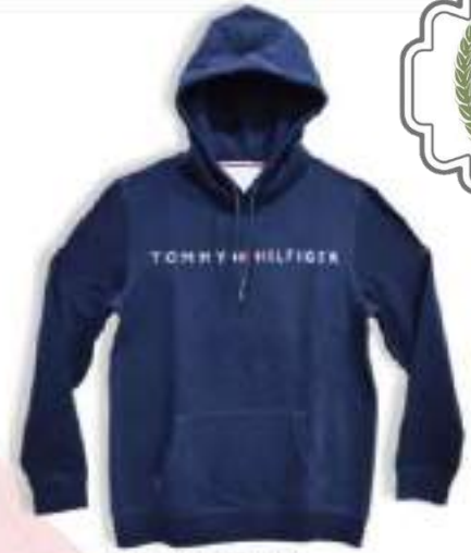
Ref No: TH-EE-M-0573 Brand: Tommy Hilfiger Fabric: Top peached & Brushed fleece Composition: 60%BCI CTN 40%Poly GSM: 300 GSM