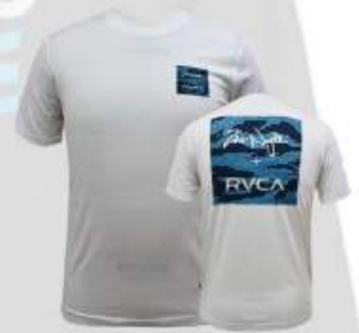
Ref No: EE-RV-M-035 Brand: RVCA Fabric: Single Jersey Composition: 100% Organic Cotton GSM: 150