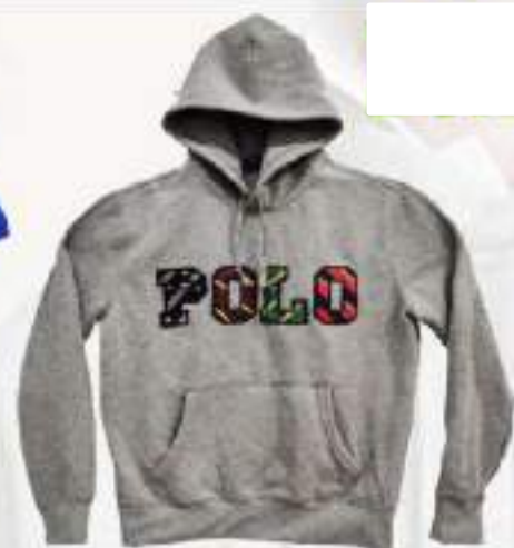
REF : TH-EE-M-0584 BRAND: POLO RALPH LAUREN FABRIC : Top peached & Brushed fleece COMPOSITION : 60%BCI Cotton 40%polyester GSM : 300