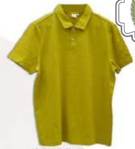
STYLE NO: TH-EE-MB13 FABRIC: Rugby jersey COMPOSITION: 100% Supima cotton GSM: 220