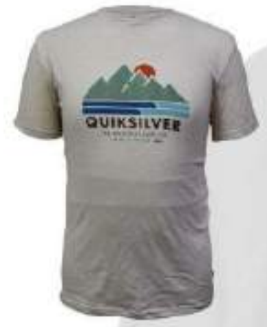
REF NO: EME-T-102 BRAND: QUICK SILVER FABRIC: SINGLE JERSEY COMPOSITION: 100% ORGANIC COTTON GSM: 150