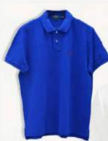
REF : TH-EE-M-0584 BRAND: POLO RALPH LAUREN FABRIC : Pique COMPOSITION : 100% BCI cotton GSM : 200