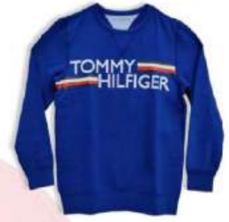
Ref No: TH-EE-M-0571 Brand: Tommy Jeans Fabric: Top peached & Brushed fleece Composition: 60%BCI Cotton 40%polyester GSM: 300