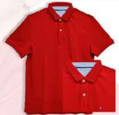
Ref No: TH-EE-M-0576 Brand: Tommy Hilfiger Fabric: Pique Composition: 100%BCI cotton GSM: 205 GSM