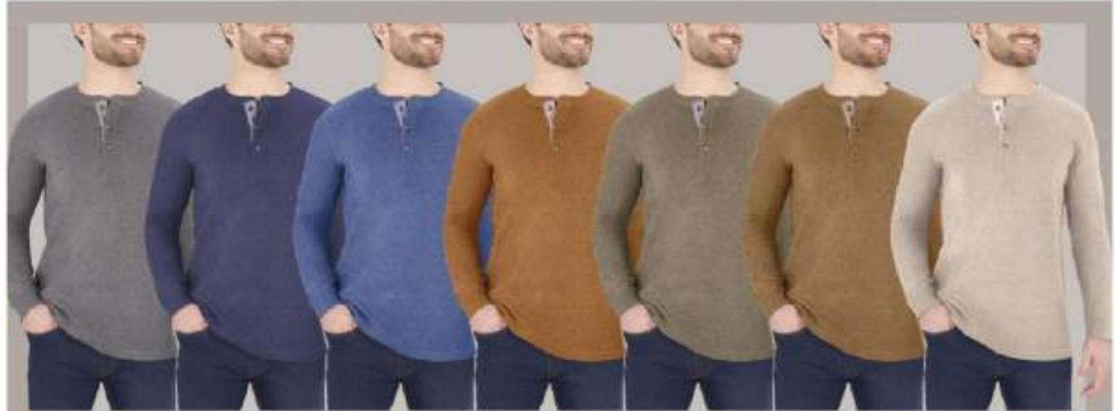
MMTH3935 CHARCOAL GREY HEAVEN