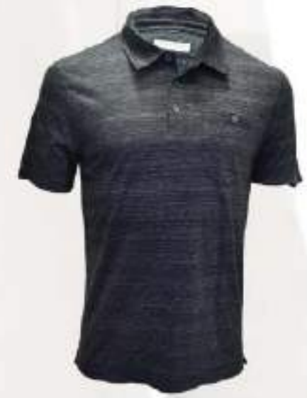
REF: EM-EL-003 BRAND: ENGLISH LAUNDRY FABRIC: SINGLE JERSEY INJECTED SLUB COMPOSITION: COTTON POLY / 55/45 GSM: 180