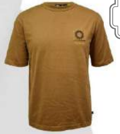
Ref No: EME-T-110 Brand: Quick Silver Fabric: Single Jersey Composition: 100% Organic Cotton GSM: 250