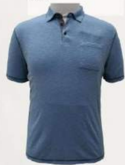
REF: EM-EL-001 BRAND: ENGLISH LAUNDRY FABRIC: SLUB JERSEY COMPOSITION: 100% COTTON GSM: 190