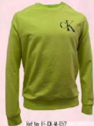
Ref No: EE-CK-M-0157 Brand: Calvin Klein Fabric: French Terry Composition: 80% Cotton 20% Polyester