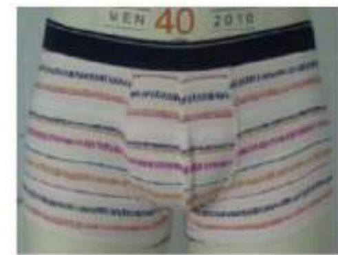
REF NO: - EE 000 FABRIC : LYCRA JERSEY COMP : 100% COTTON GSM : 160