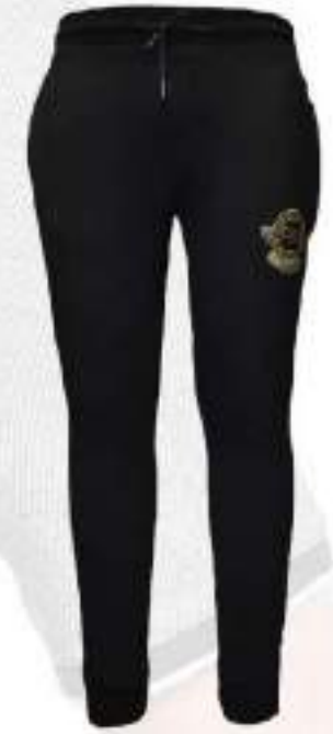
Ref: EN-POL-007 Brand: Police Fabric: Double Knit Composition: 100% Poly GSM: 300