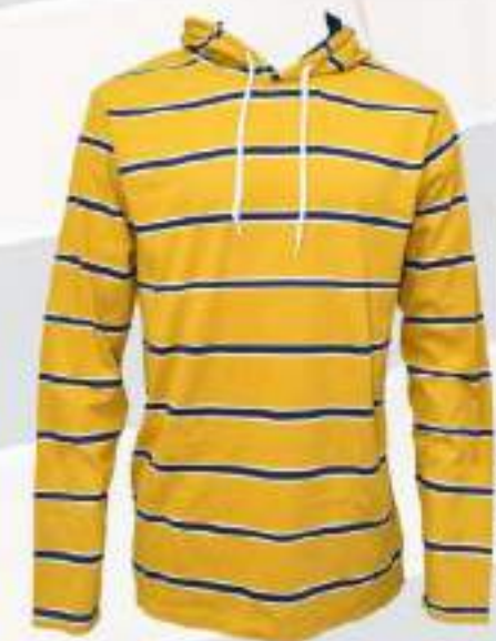
REF NO : 407469 BRAND :OLD NAVY MEN'S FABRIC :HEAVY SINGLE JERSEY COMPOSITION :80% COTTON - Y/D GSM :220