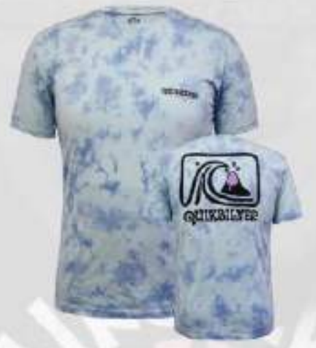
REF NO: EME-T-111 BRAND: QUICK SILVER FABRIC: SINGLE JERSEY COMPOSITION: 100% COTTON GSM: 150