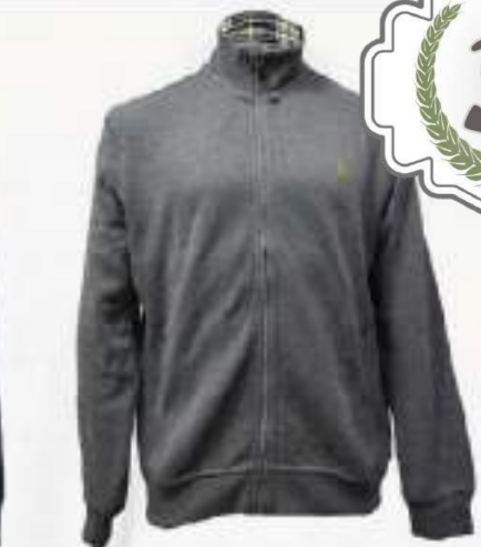
REF : POLO RL-013 BRAND: POLO RALPH LAUREN FABRIC : MÉLANGE FLAT BACK RIB COMPOSITION : 100% COTTON GSM : 380 / PEACHED