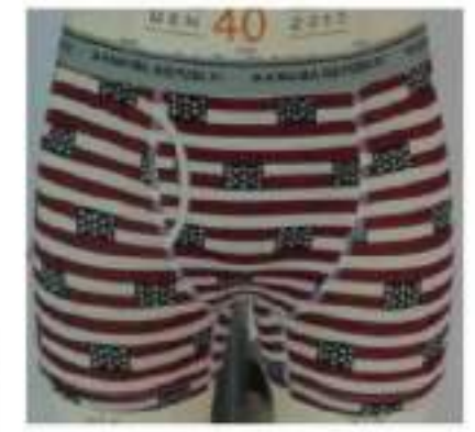
REF NO: - EE 017 FABRIC : LYCRA JERSEY COMP : 93% COTTON, 7% SPANDEX GSM : 185