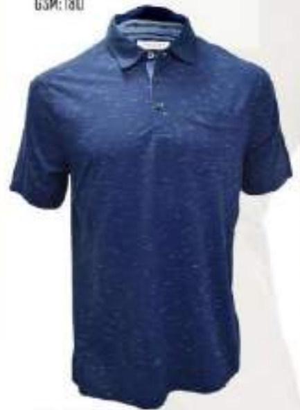
REF: ENGLISH LAUNDRY - 002 BUYER: ENGLISH LAUNDRY FABRIC: INJECTED SLUB JERSEY COMPOSITION: 100% COTTON GSM: 180