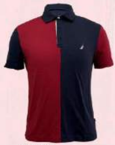
STYLE 40-16 BUYER: NAUTICA FABRIC: SINGLE JERSEY COMPOSITION: 100% COTTON GSM: 210