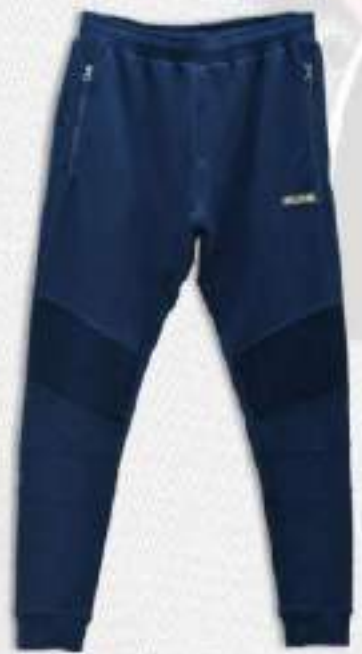
Ref: TH-EE-M-0607 Customer: Police Description: Mens Pant Fabric: Loop knit - 100% cotton