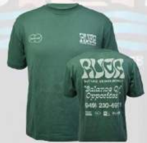
Ref No: EME-T-101 Brand: RVCA Fabric: Single Jersey Composition: 100% Cotton GSM: 200