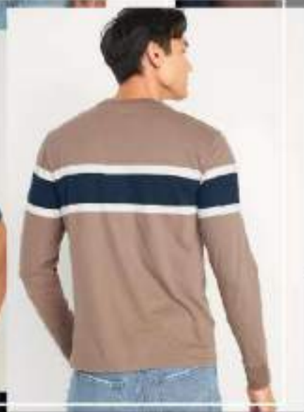
REF NO : 407468 BRAND :OLD NAVY MEN'S FABRIC :FLEECE COMPOSITION :60% COT 40% POLY GSM :280