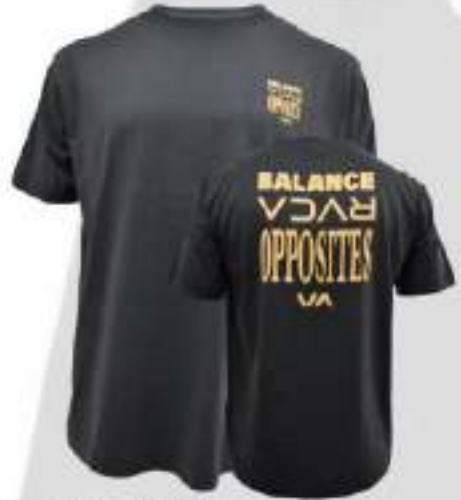
Ref No: EE-M-074 Brand: RVCA Fabric: Single Jersey Composition: 100% Organic Cotton GSM: 150