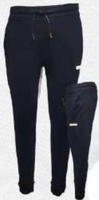
Ref: 50 Customer: Police Description: Mens Pant Fabric: 100% Ctn French Terry 360gsm