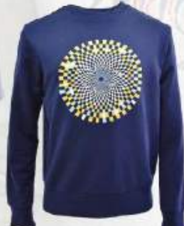
Ref No: EE-BS-M-005 Brand: Ben Sherman Fabric: Fleece Composition: 100% Organic Cotton GSM: 330