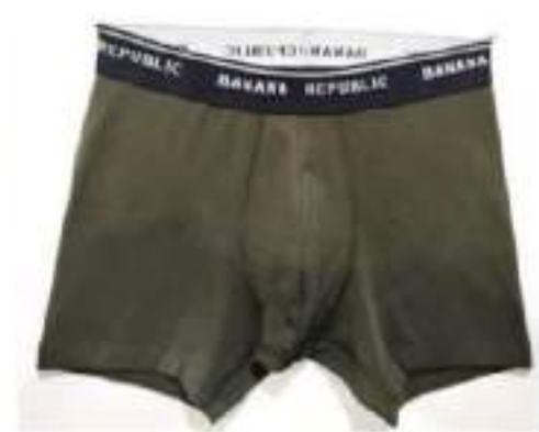
REF NO: BANANA REPUBLIC - SOLID FABRIC : 93% SUPIMA COTTON 7% SPANDEX, XXI RIB