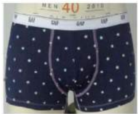
REF NO: - EE 003 FABRIC : LYCRA JERSEY COMP : 93% COTTON, 7% SPANDEX GSM : 75