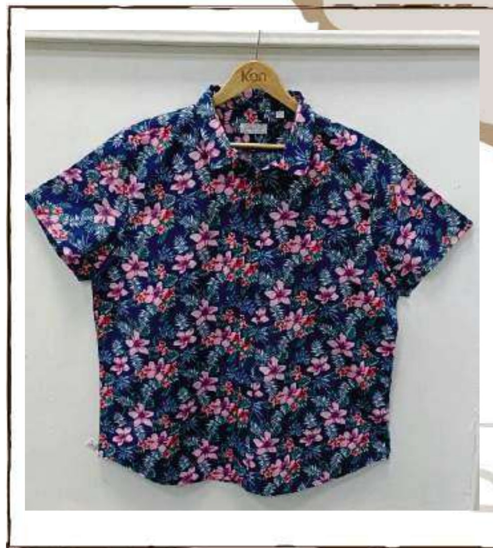
Style No: KEN-MSDV-10

Style Description: Men's S/S shirt Fabric: 100% cotton, 40x40/104x72