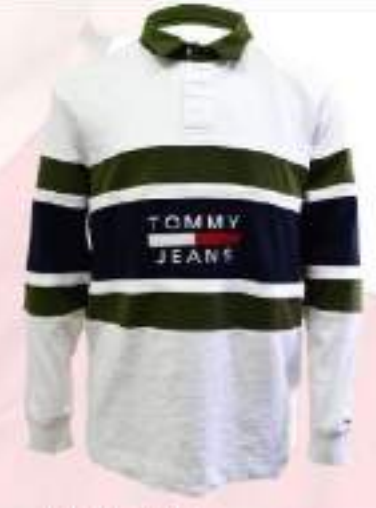
Ref No: EE-TJ-M-007 Brand: Tommy Jeans Fabric: Single Jersey Composition: 70% Cotton 30% Polyester GSM: 220