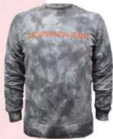
REF NO: EME-ST-122 BRAND: CALVIN KLEIN FABRIC: DIAGONAL LOOP BACK TERRY COMPOSITION: 100% COTTON GSM: 400