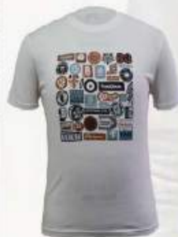
STYLE NO: 52 BUYER: BEN SHERMAN FABRIC: SINGLE JERSEY COMPOSITION: 100% COTTON GSM: 150