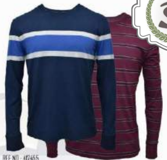
REF NO : 407455 BRAND :OLD NAVY MEN'S FABRIC :SINGLE JERSEY COMPOSITION :60% COT 40% POLY GSM :175