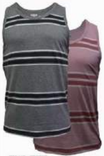
REF NO : 879325 BRAND :OLD NAVY MEN'S FABRIC :SINGLE JERSEY COMPOSITION :100% COTTON GSM :150